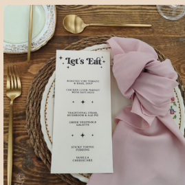
MENU CARDS £1.50