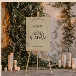
TABLE PLAN/WELCOME SIGN A2 SIZE DOUBLE SIDED £95