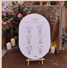
ARCH TABLE PLAN A2 SIZE (THE SIZE ON DISPLAY) £75