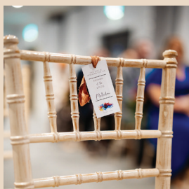
RESERVED TAGS WITH RIBBON £1.75