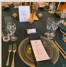
PLACE NAMES £1.50