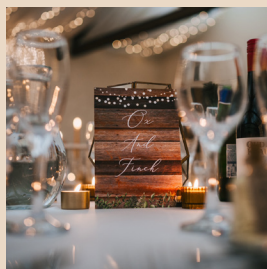
TABLE NAMES DOUBLE SIDED £3