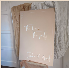
WELCOME SIGN/TABLE PLAN A1 SIZE (THE SIZE ON DISPLAY) WITH ACRYLIC LETTERING DOUBLE SIDED £125